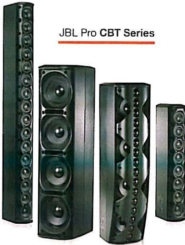
JBL Pro CBT Series